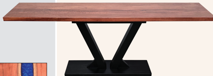
Murray River Red Gum Hall Table