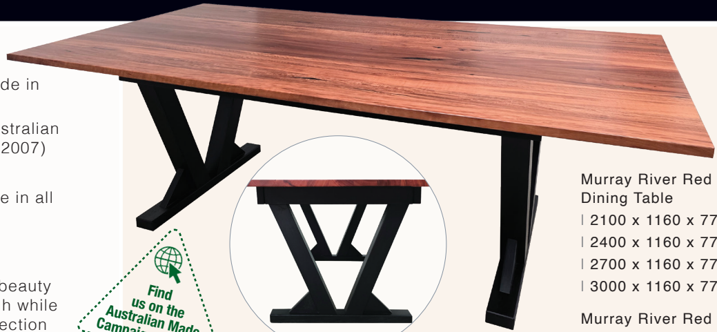
Murray River Red Gum Dining Table