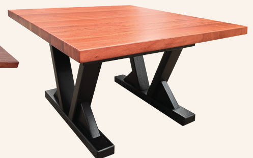
Murray River Red Gum Lamp Table