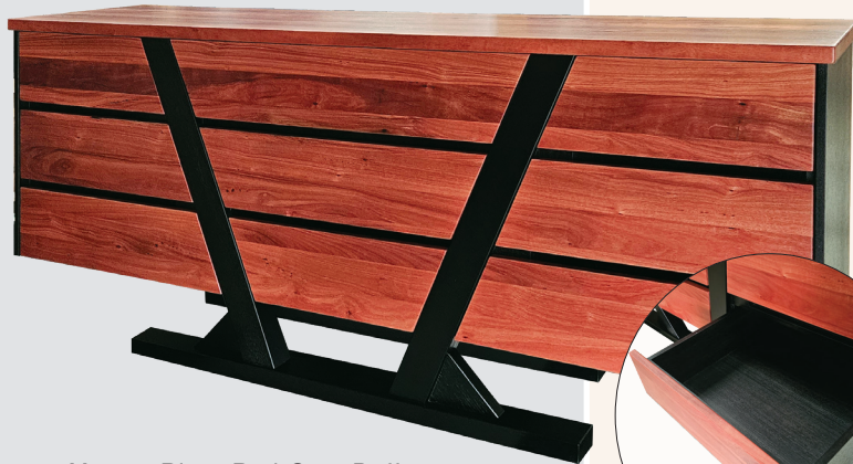
Murray River Red Gum Buffet