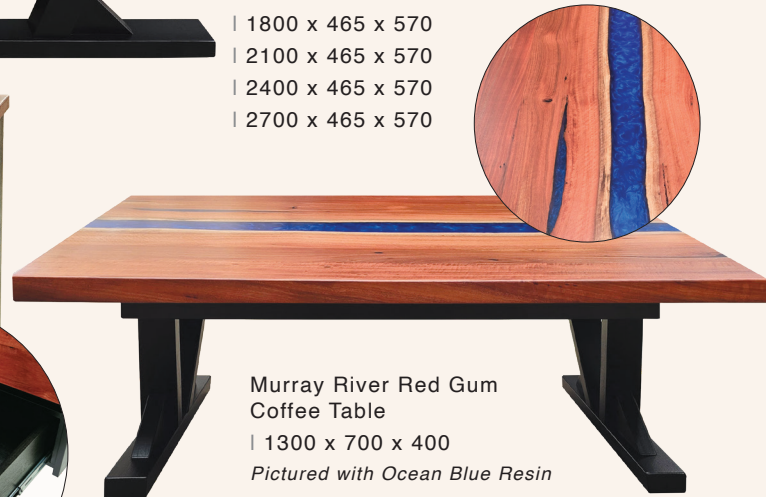
Murray River Red Gum Coffee Table