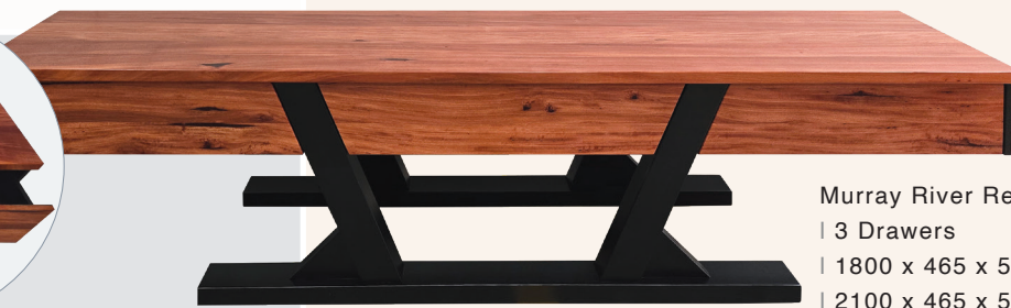
Murray River Red Gum Entertainment Unit